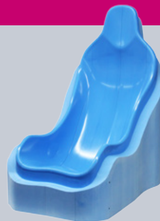
Master model for racing seat tool made of ebaboard EP 138